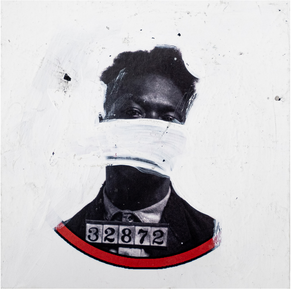
"Untitled," acrylic collage, by Marlena Marie Wilding. 2014